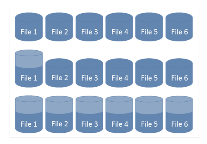
Figure 3: Using trace flag 1117 to adjust autogrowth behavior

Since SQL Server 2008, customers can change autogrowth behavior so that all data files are grown to the same size (assuming the autogrowth rate is set consistently), instead of growing only one data file at a time. Further, with SAP installations on SQL Server 2012, the proportional autogrowth behavior described with trace flag 1117 is set automatically. For more information about proportional file autogrowth, see SAP note 1238993.