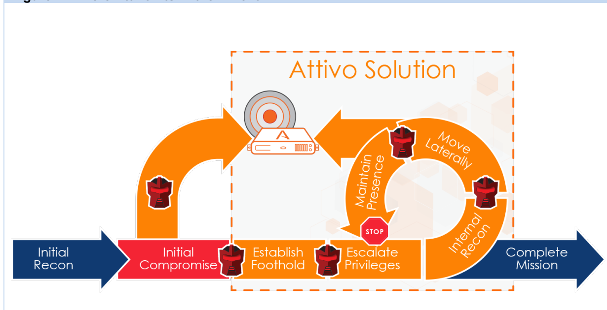
Figure 1: Where Attivo fits in the kill chain