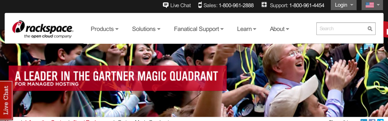
Home / Information Center / About Rackspace / Gartner Magic Quadrant